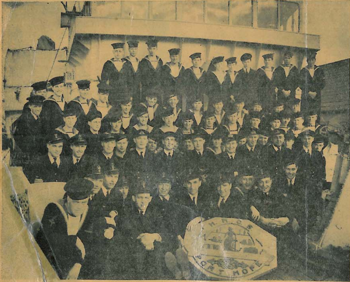
Officers and men on deck of H.M.C.S. Port Hope during dedication ceremony.